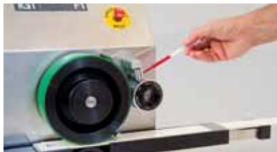
Applying the ink voor flexo printing

The low-cost version is the F1 Basic. In this version the printing speed can be pre-programmed from 0,2 to 0,9 m/s. The anilox/printing force can be programmed in three combinations between 20 and 500 N. The F1 Basic is used when there is no need to change the speed or anilox- and printing force once it is set to the optimal values. This tester is specially used in QC of inks and substrates.